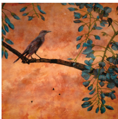
'Future Predecided' (from top); 'Mockingbird'; 'Grackle'; 'Butterfly Effect VI' (opposite page); League's process

artifacts and imagery is simple, primal and speaks to my soul.