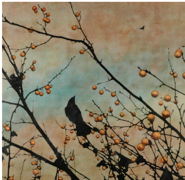
'Plum Blossoms and Crows' (top); 'Entre Nous'